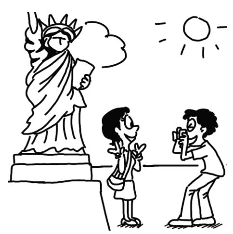
Part 2: Best Response Questions (2%)

Listen to the question or statement and choose the best response.